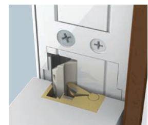
The Multi-Point features patent pending lock pawls activated by the deadbolt to engage keepers in the active door, providing three locking points. No deflection.

Endura's Multipoint Astragal combines the strength and support of a multi-point lock with Endura's Ultimate Astragal to provide: